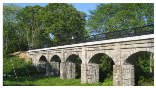
Bogastow Brook Viaduct, constructed 1846